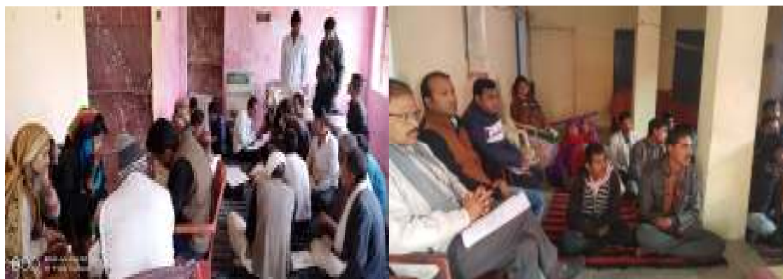
(GP MUARI and GP lohari)