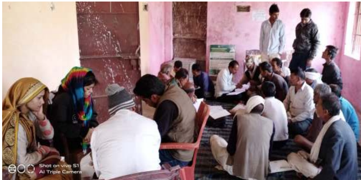
Gram Sabha Meeting in MUARI GP